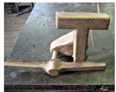
Metal letter with gating still attached