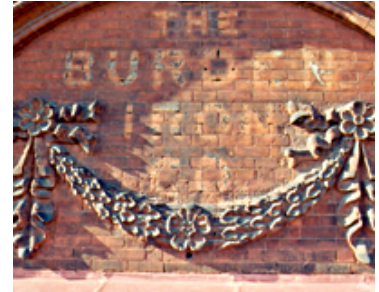
Burden Iron Works missing letters

"We do know that they were long gone when the Hudson Mohawk Industrial Gateway acquired the building from Republic Steel in 1974. We also know that they were still on circa 1920, because we have a copy of a little sales catalog