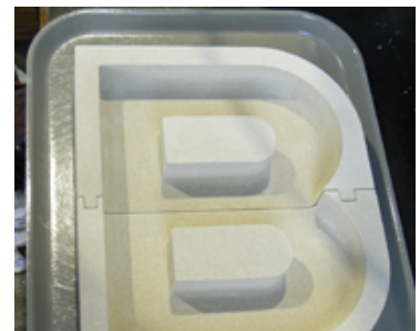
ZCast mold ready for metal