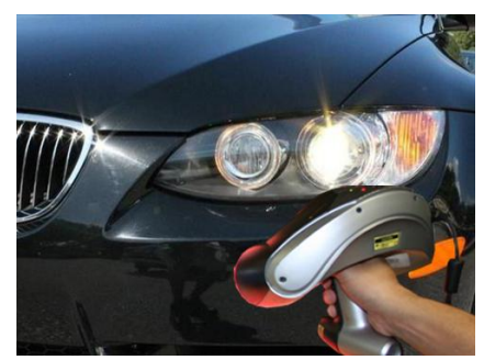
3D Scanning a BMW M3