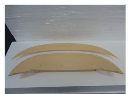
CNC machined master patterns of chin & rear spoiler